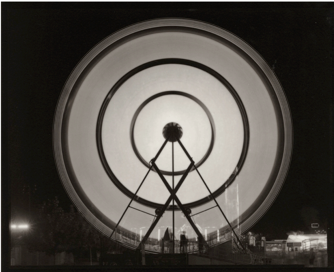
Sky Diver, 1996. Platinum/palladium print

In 1970, Vail began photographing carnivals and their thrill rides with his 8 x 10 inch view camera. His pictures were made in the evening hours with long exposure times, resulting in extended moments which track the momentum of the ride with a sense wonderment that is both tangible and otherworldly.