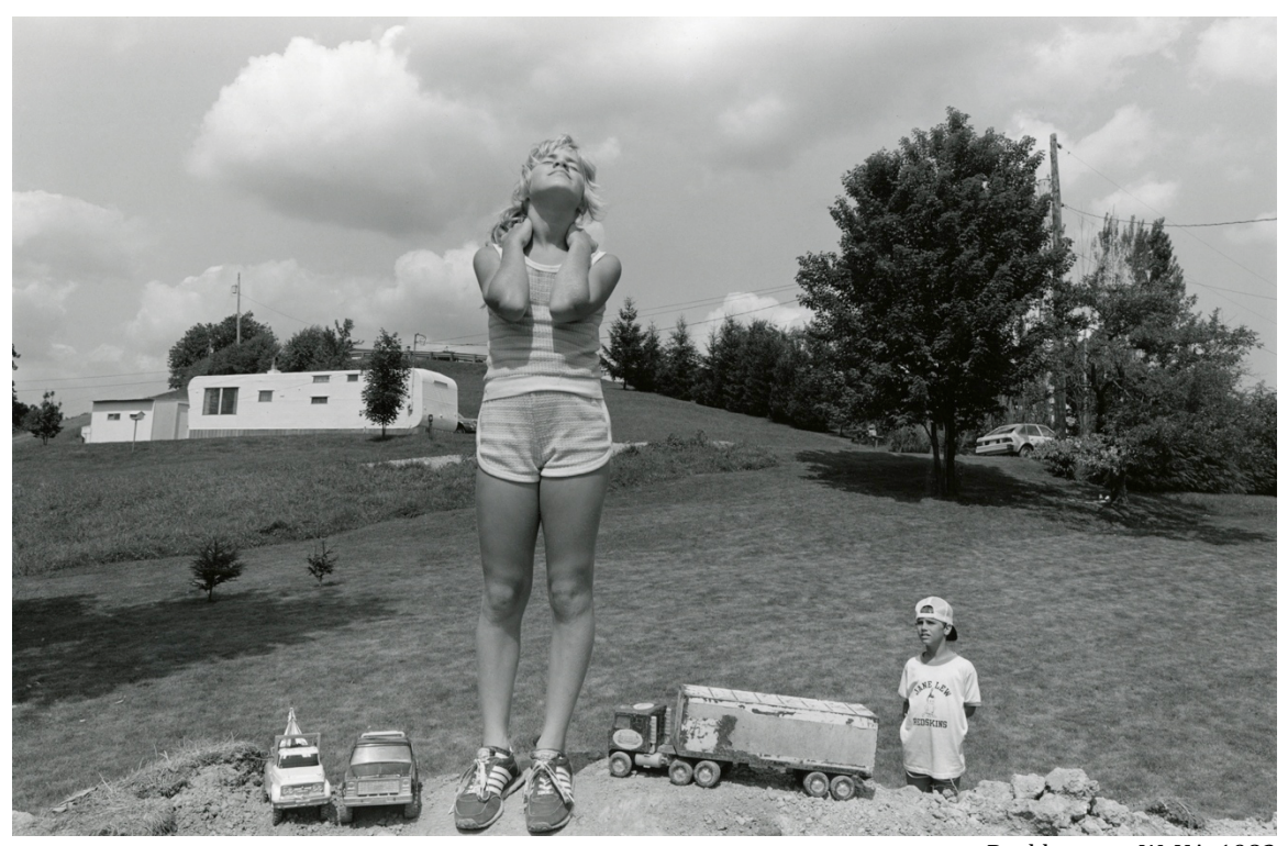
Buckhannon, W. VA, 1982